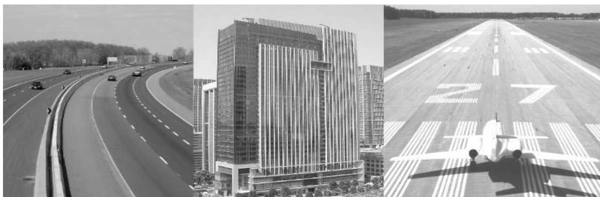
Expansion joint filler boards usage in highways, large buildings, airport runways